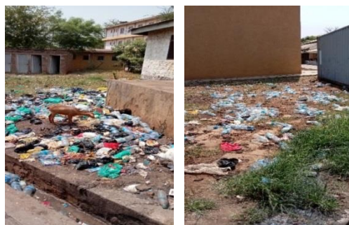
Figure 6. Evidence of Random dumping at JTH.

struct such people to collect their waste and throw into designated waste bins or disposed at the temporal disposal site.