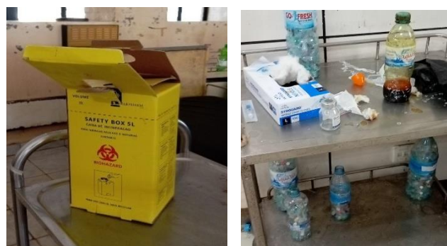
Figure 3. Segregation of sharps using safety box and water bottles.