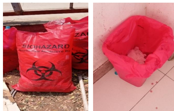
Figure 5. Colored bags (red).