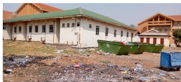
Figure 8. Open Burning at JTH.