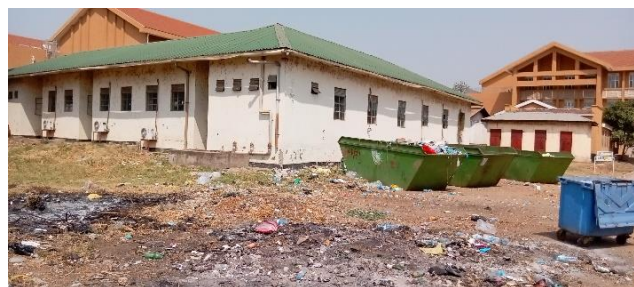
Figure 9. The temporal disposal site at JTH.

A related study in South Sudan revealed that waste pickers working with recyclable materials are at higher risk of developing pulmonary diseases and hepatitis C as a result of contact with sharp items and hazardous clinical solid waste [29].