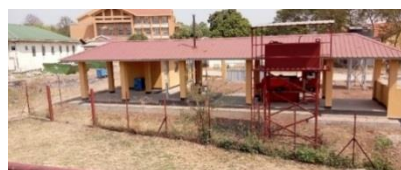
Figure 7. The operational incinerator installed by MSF and the newly installed by WHO.