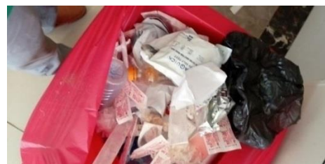
Figure 4. Shows a colored bag (red) with different types of solid waste mixed together.